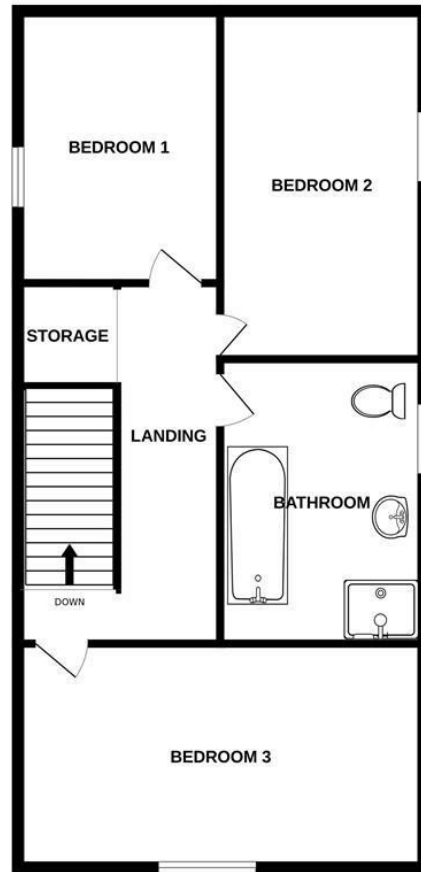
1ST FLOOR 795 sq.ft. (73.8 sq.m.) approx.